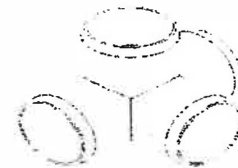
Fig. 1 - 4 Way Tee

For maximum strength the assembly of this unit should be glued together using PVC cement, available at most hardware stores. All fittings should be glued with the exception of the Slip Tee's. This glue is permanent, so dry fit all of the components before final assembly. Once the parts are glued together they can not be removed or replaced.