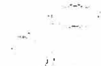
Fig. 2 - Slip Tee