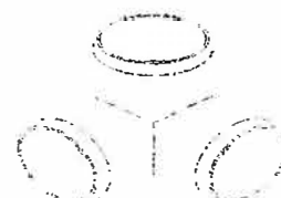
Fig. 4 - 3 Way Tee